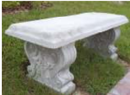
Concrete Bench $1,000