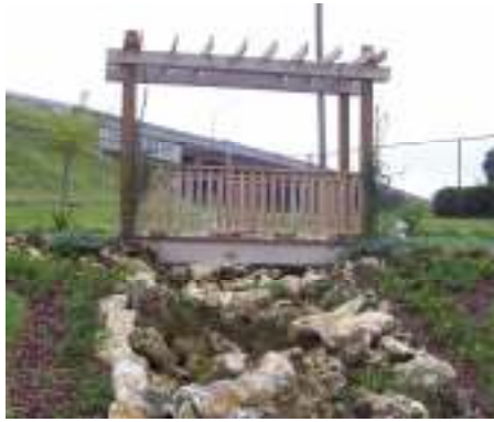
Covered Bridge $5,000