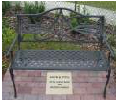
Metal Bench $1,000