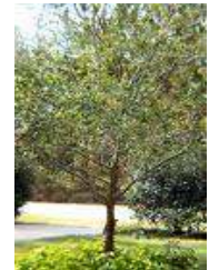
Dogwood Tree Drake Elm Tree $250