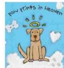
Memorial Book $20