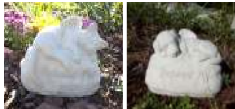
Cat & Dog Angel Statue $35